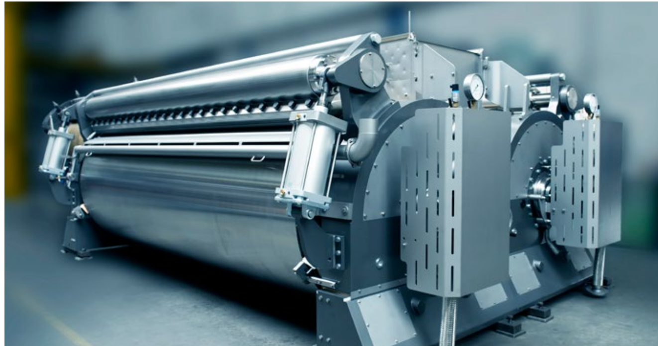
ANDRITZ Gouda double drum dryer

When brewing beer, yeast is produced as a by-product. This product is usually treated as waste. Brewer's yeast, however, contains valuable ingredients, such as amino acids, proteins, and minerals. These ingredients can be re-used in several food products. For this purpose, ANDRITZ has developed an efficient drying process.