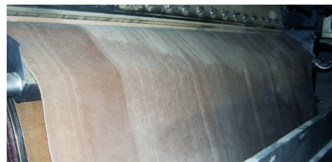
Dried yeast on the drum dryer

Compared to direct drying processes, indirect drying on an ANDRITZ Gouda contact drum dryer requires less hot air to achieve evaporation. The heat is generated by steam, for instance, and the (metal) wall of the drum transfers the heat to the product. The wall of the drum ensures that all the heat is used to dry the product and does not leave the machine or chimney unused. This makes indirect drying a much more efficient process. An added advantage is the fact that large dust recovery systems (such as filters) are no longer necessary because there are no large amounts of drying gas. To ensure low emission values, it is recommended to clean the exhaust vapors in a small biofilter before releasing them into the atmosphere.